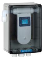
Industrial Enclosure HH ENC