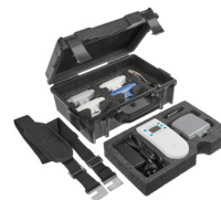
Carry Case Large AS R41