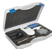
Carry Case Small AS R40