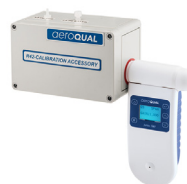
Calibration Kit AS R42