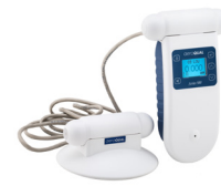
Remote Sensor Kit AS R10